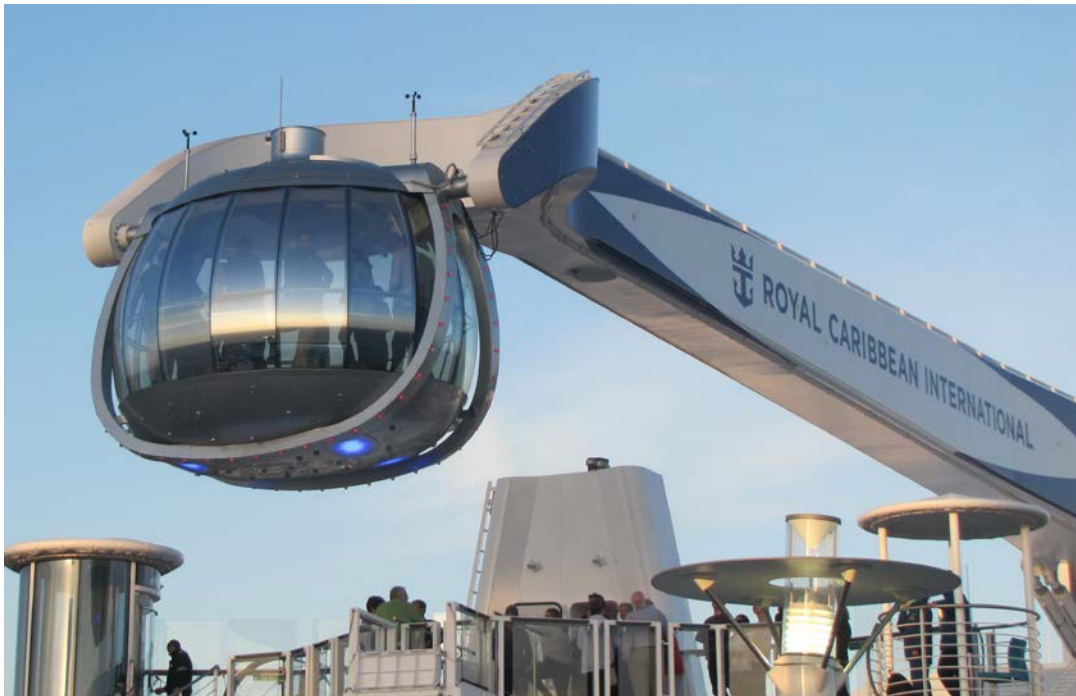
Gangloff Cabins also produces special solutions: Sightseeing gondola „North Star“ on the cruise ship „Quantum of the Seas“

Gangloff Cabins continues to draw on its technical expertise and develop customised aerial tram cabins, funicular railway cars and special productions. Cable car cabins are also built at the traditional company in Bern and Gangloff Cabins plans to further increase work in this area in the future. Using refined technology in the modular system, different sized cabins for 4 to 10 people can be produced efficiently. In addition, a new and innovative generation of cabins is in development.