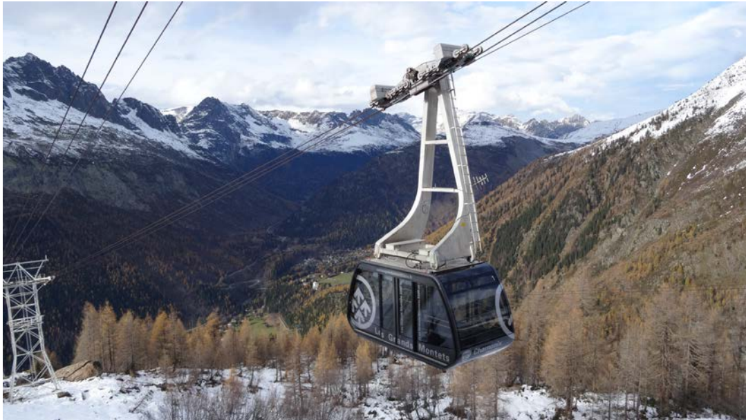
The new cable car on the Argentière – Lognan lift at Chamonix-Mont-Blanc

In Spring 2015 Gangloff Cabins is moving to a larger premises, ideal for the flow of production. The new premises are situated in an industrial quarter of Seftigen, a community on the edge of the upper Gürbetal Valley between Thun and Bern. The new premises are a convenient two minute walk away from Burgistein station. The new premises will also allow Gangloff Cabins, as an independent operation, to bring its full range of expertise under one roof (development, construction, production, service and spare parts) and provide its customers worldwide with the best quality and impeccable service.